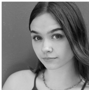
Ada Grey Senn Arts High School