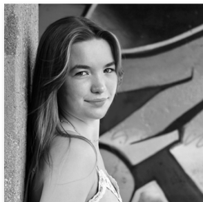
Ella Bullock Walter Payton College Prep